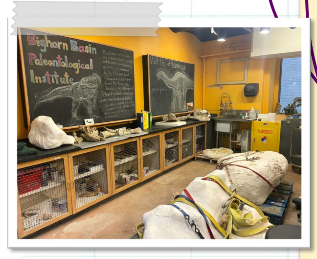
So much progress in the Fossil Prep Lab!!!