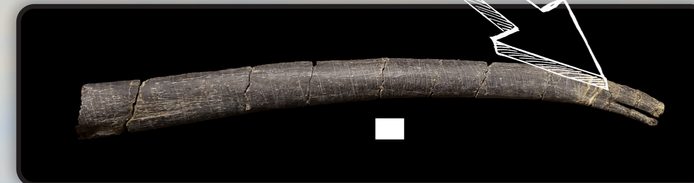
Figure 2. Diplodocus sp. cervical rib. Proximal (left); distal (right). Scale = 1cm.